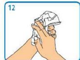
12 Dry thoroughly with a single-use towel