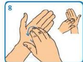
8 Rub tips of fingers in opposite palm in a circular motion