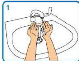
1 Wet hands with water