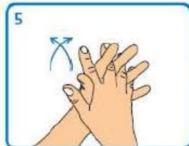
5 Rub palm to palm with fingers interlaced