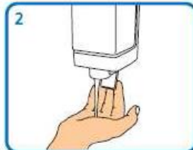
2 Apply enough soap to cover all hand surfaces