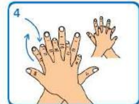
4 Rub back of each hand with palm of other hand with fingers interlaced