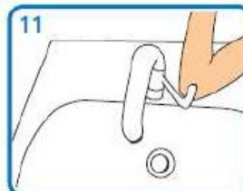
11 Use elbow to turn off tap