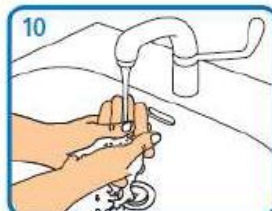
10 Rinse hands with water