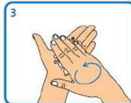
3 Rub hands palm to palm