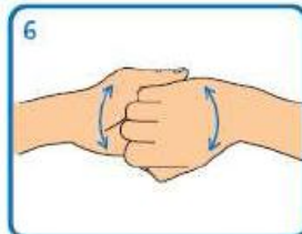
6 Rub with back of fingers to opposing palms with fingers interlocked