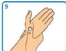
9 Rub each wrist with opposite hand